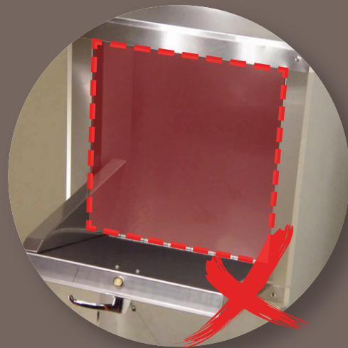
Unacceptable size: Items wider than door intake opening