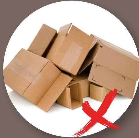
Unacceptable in chutes: Will clog at the base of the chute