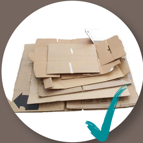
Acceptable in chutes: Fold down boxes